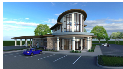
PECU's Round Rock branch will host the event!